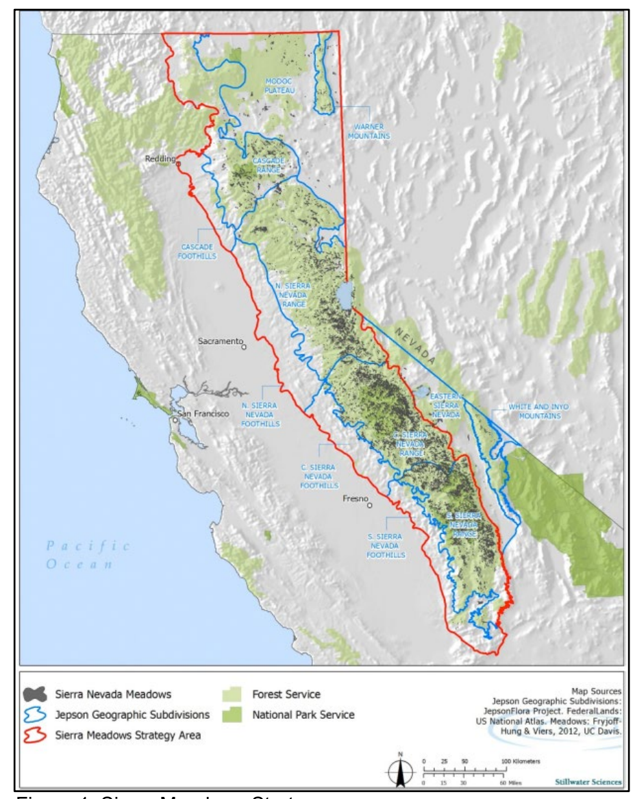
Figure 1. Sierra Meadows Strategy area.

Projects must be located within the boundaries of the Sierra Meadows Strategy geography (Figure 1).